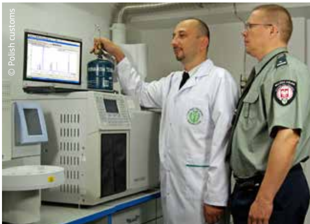
Ensuring the safety and security of citizens is increasingly a high-tech business.

Customs cooperate with relevant authorities to ensure the security and safety of citizens and the protection of the environment. Customs officers and authorities are a vital partner for the European Police Office, Europol, in battling organised crime. They also liaise with Eurojust, the European network of judicial authorities that underpins European cooperation on criminal justice cases, and the European Anti-Fraud Office.