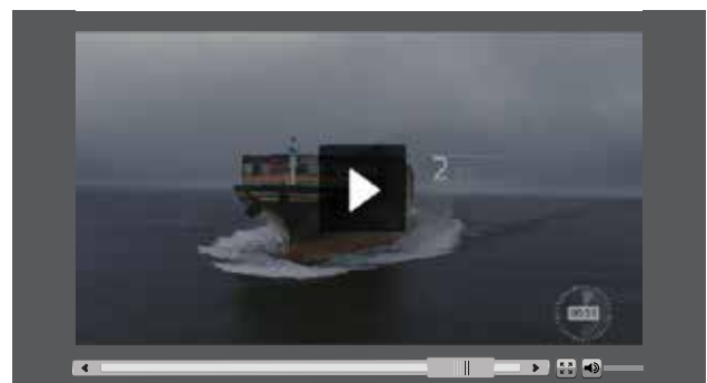
Video: experience 1 minute on a normal customs day.

Customs operations in the EU now account for around 16 % of world trade, handling imports and exports worth over €3 500 billion every year. The scale of