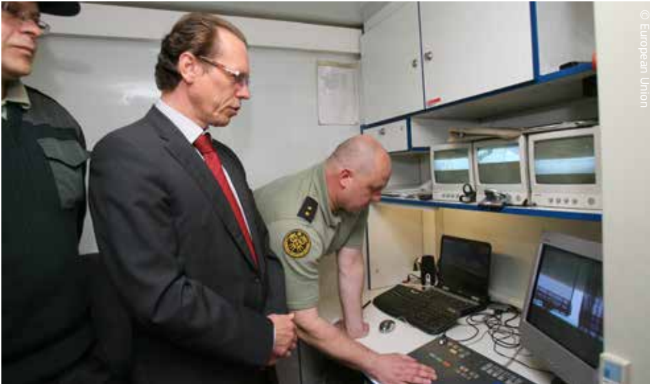
Algirdas Šemeta, the commissioner responsible for customs, watches the result of an x-ray scanner during a visit to the Panemunė border inspection post between Lithuania and Russia.