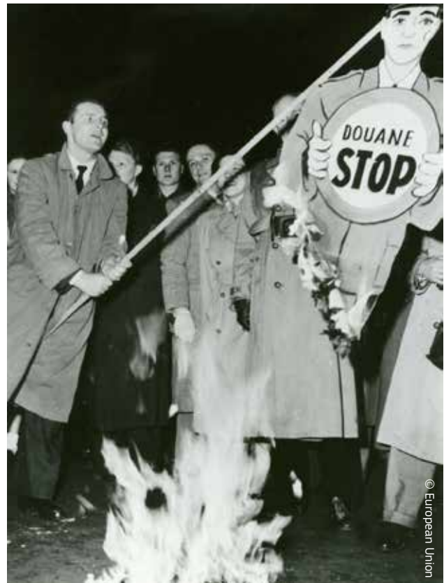
Members of the Belgian section of the European Movement demonstrated against border controls in Liège in 1953.

At each subsequent enlargement of the European Union, the new countries also joined the customs union, reconciling their national laws with the Community Customs Code. Monaco, a non-EU state, was already in a customs union with France, while Andorra and San Marino established agreements in 1991. The EU–Turkey customs union entered into force in 1995 but, like the agreement with Andorra, is limited to industrial products and processed agricultural products.