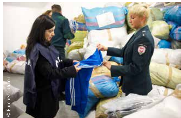
Examining seized counterfeit products.

Custom authorities also perform a vital role in collecting statistics. The trade flow data they collect help European policymakers detect economic trends, while information in their records contributes to decisions on whether to introduce limits on goods that may be competing unfairly with EU products.